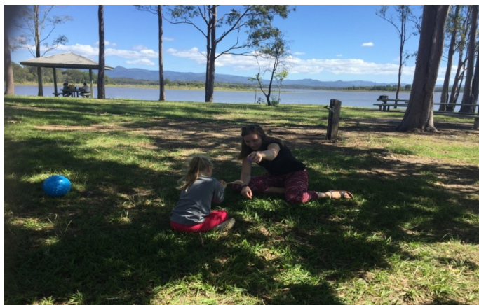
Right photo: Hope having a serious conversation with a child at North Pine Dam