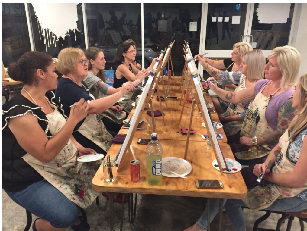
Staff and management committee members at our Christmas party.