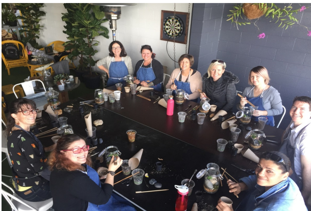
Building terrariums, staff and management committee at our team building day